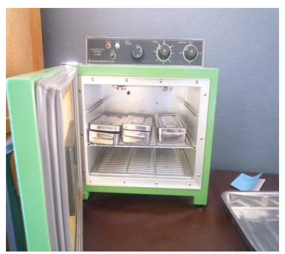
Figure 10: Modern disinfector