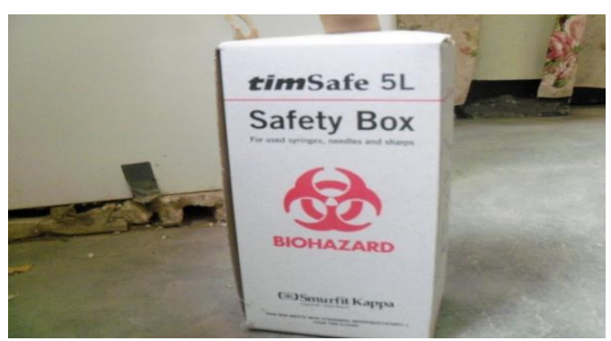
Figure 2: Safety box for collection of sharp objects

Although the sorting of different waste was respected, all the containers used (except safety box) did not obey any standard and all did not exhibit any universal biohazard sign that is commonly used in many countries. This is very dangerous as it may result in cotton contaminated with infected blood or contaminated injection equipment being scavenged and reused. More to this, is the fact that all the waste collected at the level of different services or wards stay there for an average of 6 to 24 hours before being evacuated to disposal sites.77 % of the health centers respect this operation and 23 % do not where sorted waste can spend up to three days before evacuation. However, in most missionary owned health centers, hygiene and sanitation was highly implemented and waste evacuation is after every one to two hours.