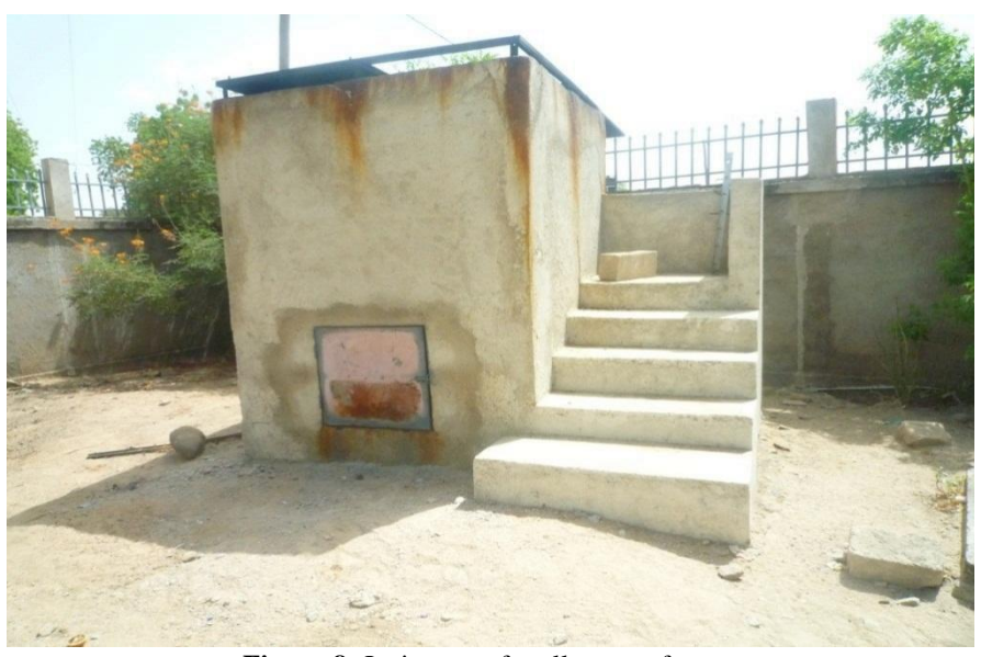
Figure 8: Incinerator for all types of waste

Solid accessories such as scissors, tubes and needles were disinfected by washing with tap water and then with chlorinated water (figure 9) and finally sterilized using a sterilizer (figure 10). Health centers without a modern sterilizer performed the sterilization by heating in pots provided for this purpose on a hot plate (figure 11). This was for the purpose of recycling. These sharps-like materials are generally known to be capable of transmitting diseases. Thus, safe handling and disposal of is an essential part of any infection control program (Mmereki et al. 2017; Jang et al. 2006). Thus, the need to extend the treatment of infectious waste to these sharps-like materials.