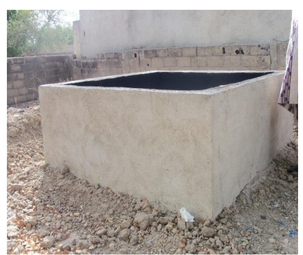
Figure 7: A brick constructed incinerator for other solid waste