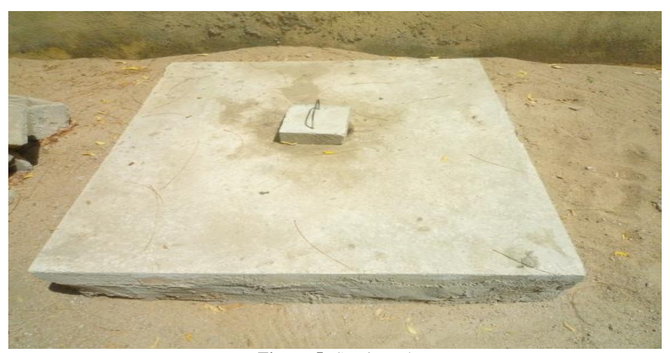
Figure 5: Septic tank