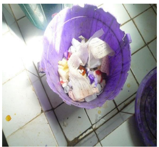
Figure 3: Garbage bin for soft solid waste