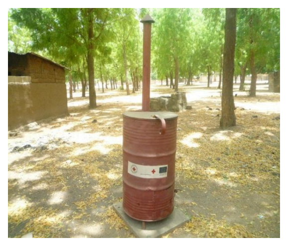
Figure 6: Local incinerator for Syringes